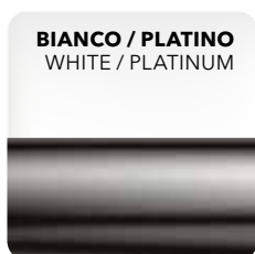
BIANCO / PLATINO WHITE / PLATINUM

esterno / exterior: METAL ORO interno / interior: BIANCO / WHITE