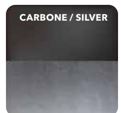
CARBONE / SILVER

esterno / exterior: SILVER interno / interior: LATTE / MILKY WHITE