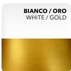
BIANCO / ORO WHITE / GOLD

esterno / exterior: METAL ORO interno / interior: BIANCO / WHITE