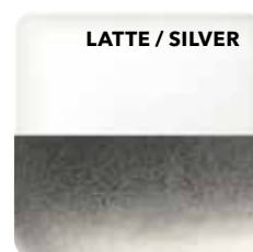
LATTE / SILVER

esterno / exterior: METAL PLATINO interno / interior: BIANCO / WHITE