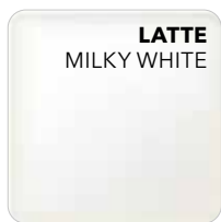
LATTE MILKY WHITE